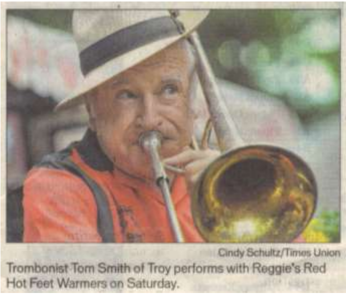
As if Cheles/Shields wasn't confusing enough ...