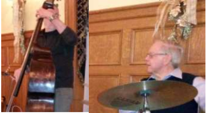
Swingtime Spring 2015