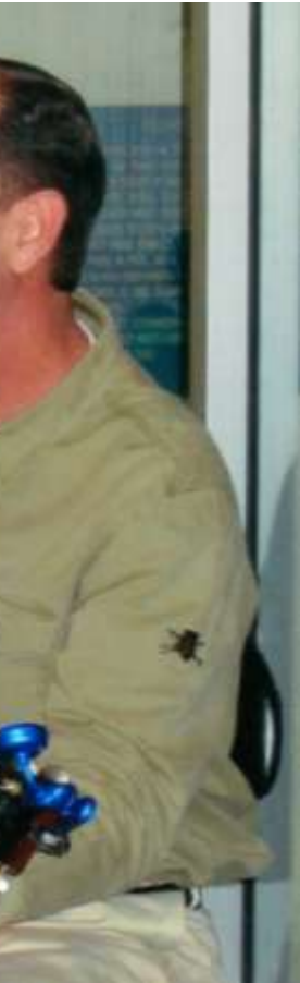
Beach, Florida (page 2)