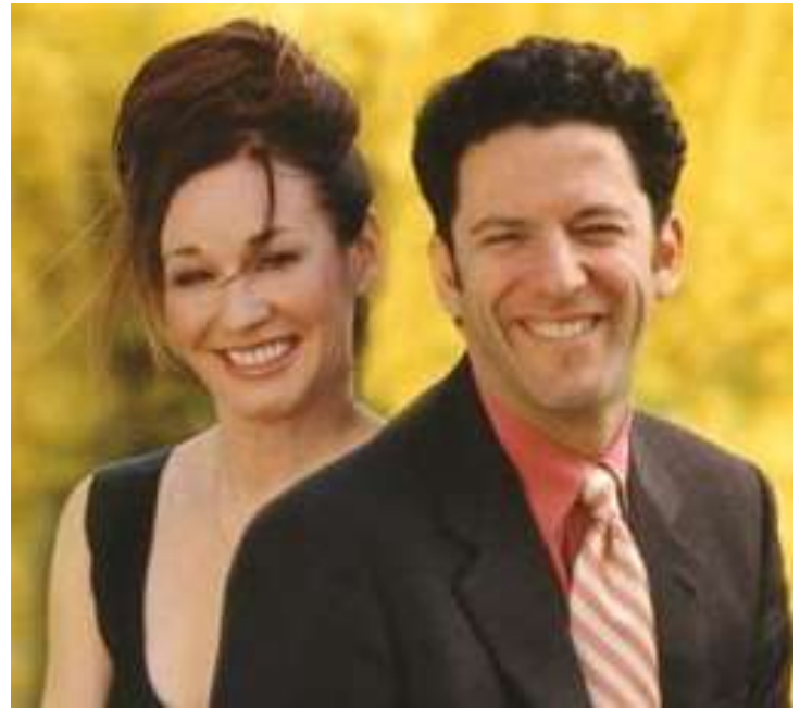
John Pizzarelli and Jessica Molaskey