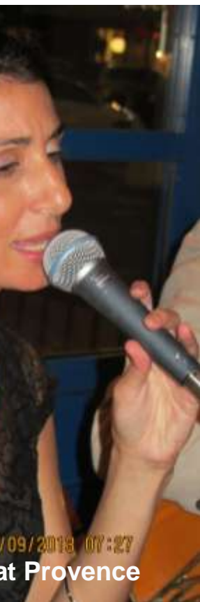
09/2018 07:27 at Provence