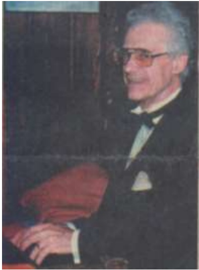
At the Wishing Well in 2011