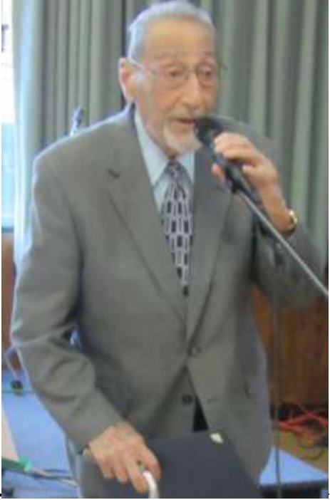
Swingtime Fall 2014 SwingtimeJazz.org Page 11